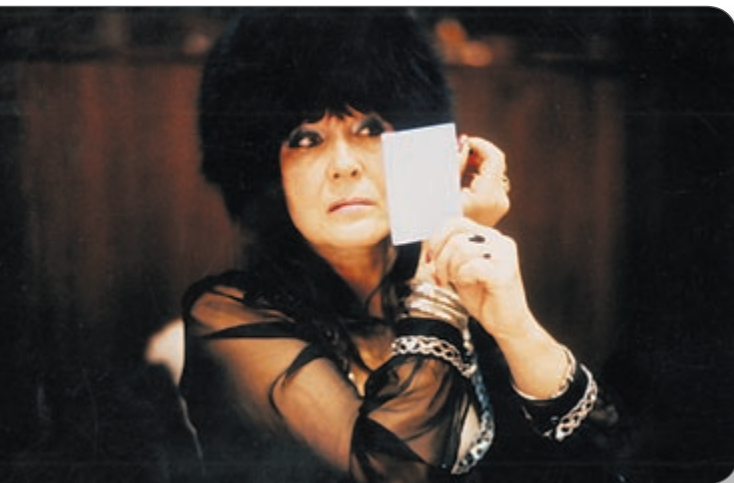
ABOVE: Constance & Grobulia, 1 st Congress