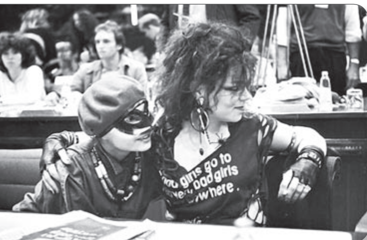
ABOVE: In the European Parliament, 2 nd Congress