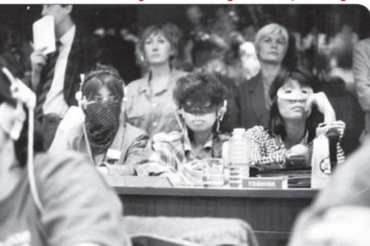
BELOW: Foundation Against Trafficking in Women, 2 nd Congress