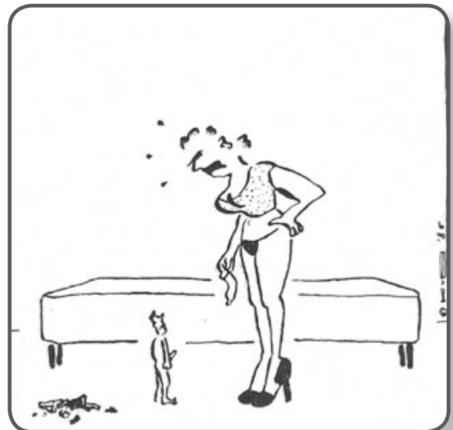
ILLUSTRATION: World Whores' News , Issue 1, 1985

♥ Gail Pheterson lives in Paris, France and is author of The Whore Stigma: Female Dishonor and Male Unworthiness (1986), The Prostitution Prism (1996) and editor of A Vindication of the Rights of Whores (1989), which features full transcripts of the First and Second World Whores' Congress.