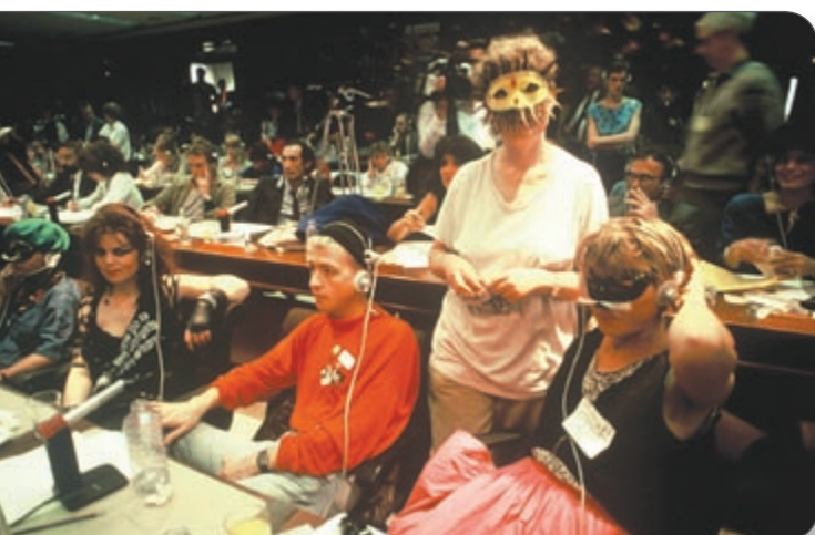
ABOVE: "Bad Girls Go Everywhere," 2 nd Congress