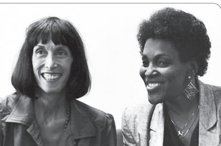
ABOVE: 2 nd World Whores' Congress, Brussels, 1986